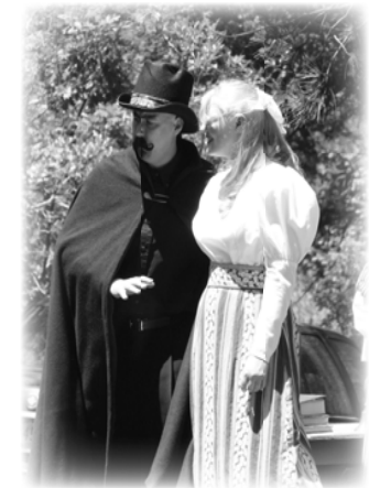
Bulldog Saves the Day, Community Melodrama, 2008.